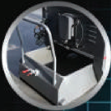
Water tank inlet