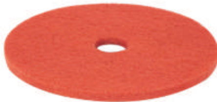
20" Scouring Pad