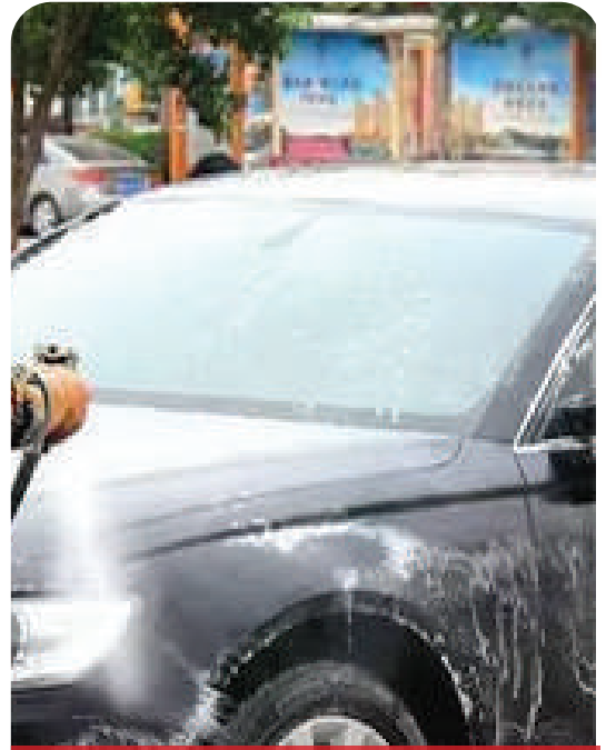
Household car washing