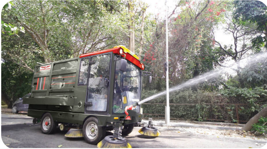
Plant Washing System

Advanced Sweeping, Water Spraying, and Dust Suppression – Ensuring Cleaner, Healthier, and Eco-Friendly Public Spaces.