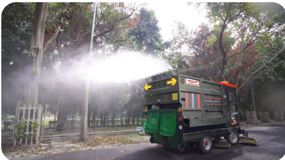
Anti Smog Spray