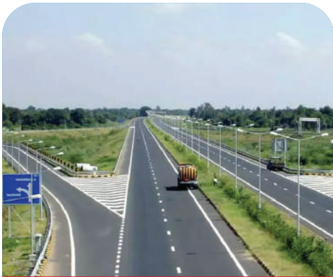
Roads & Highways

The DTMS-6000 EV battery-operated sweeper is designed for heavy-duty cleaning in various public and industrial spaces. It ensures efficient dust and debris removal, making it ideal for: