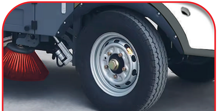
Durable Rubber Tyres