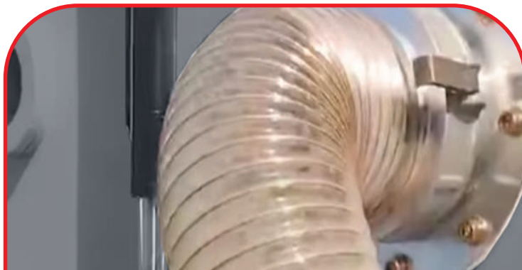
Strong Vacuum Cleaner