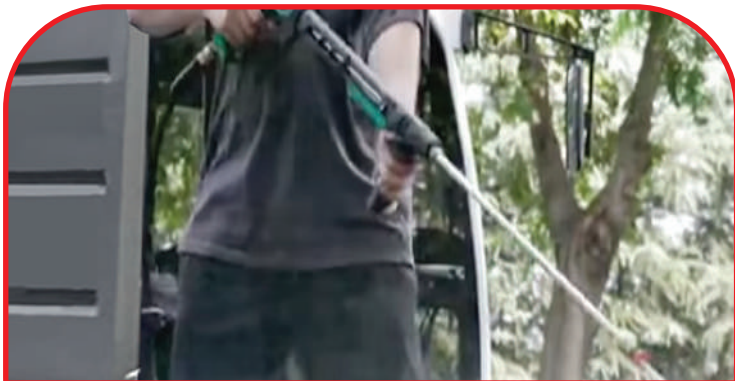
High Pressure Water Gun

From precision brushing to high-power vacuuming – every detail of DTMS-5000 EV is built for next-level street cleaning.