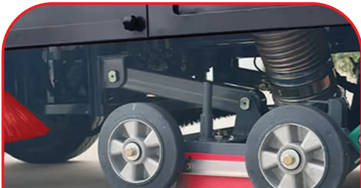
Side Brush and Vacuum Cleaner