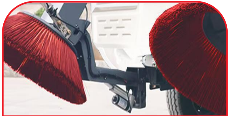
High Density Edge Brush