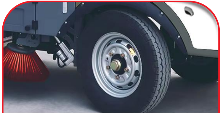
Durable Rubber Tyres