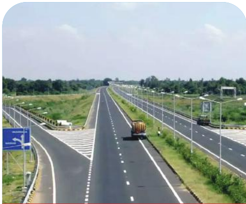
Roads & Highways

The DTMS-4000 EV battery-operated sweeper is designed for heavy-duty cleaning in various public and industrial spaces. It ensures efficient dust and debris removal, making it ideal for: