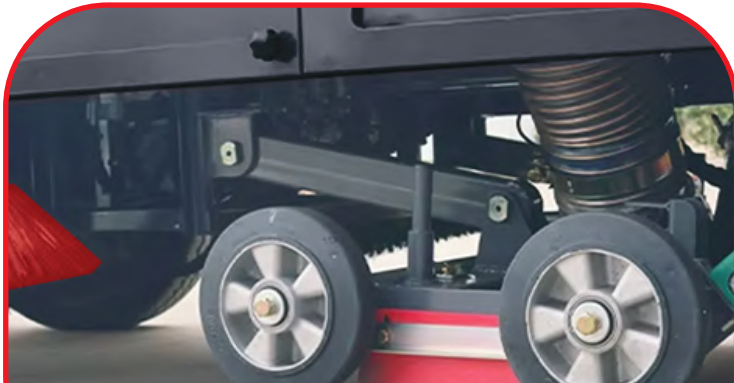
Side Brush and Vacuum Cleaner