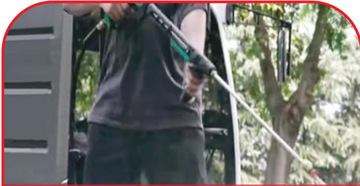
High Pressure Water Gun

From precision brushing to high-power vacuuming – every detail of DTMS-4000 EV is built for next-level street cleaning.